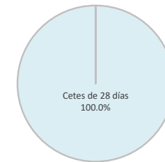
MULTIRE Carteras al cierre del 29-may-26