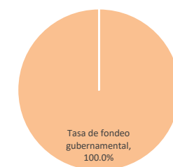
MULTINS Carteras al cierre del 30-abr-26